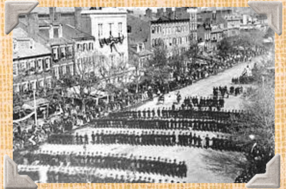
The train that carried Lincoln in the procession