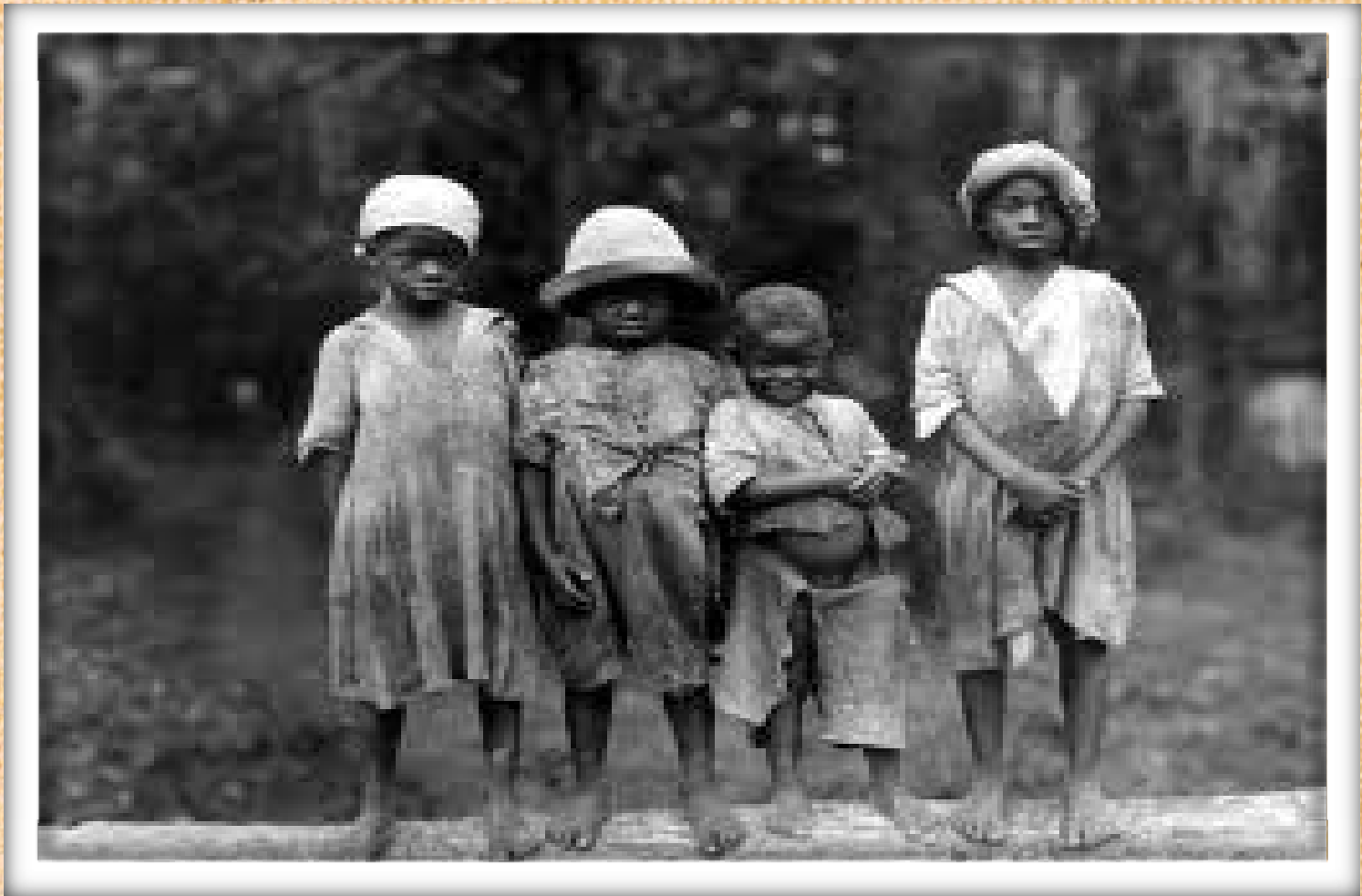
Faces of Reconstruction