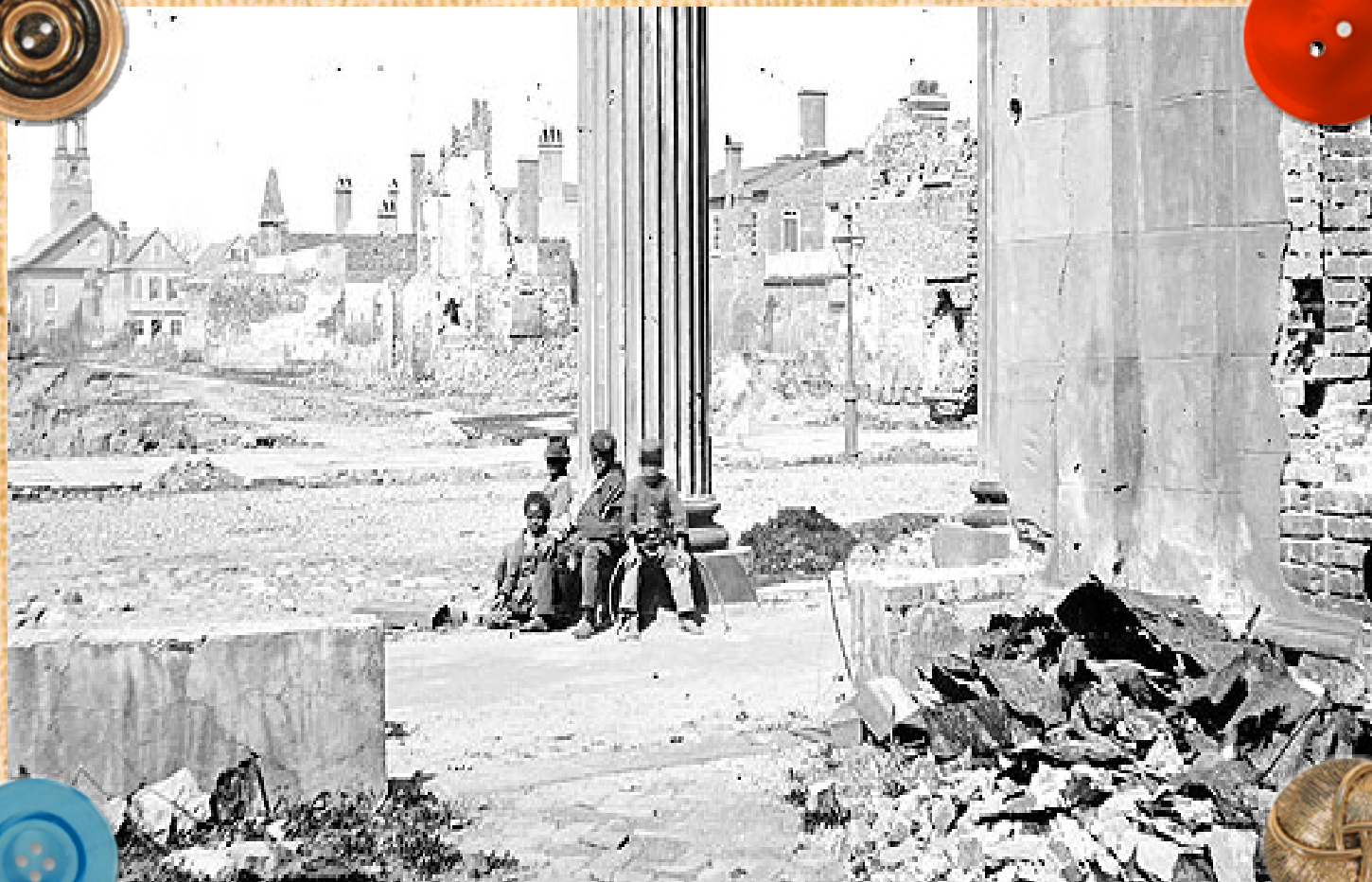
Charlston Virginia in ruins after the Civil War