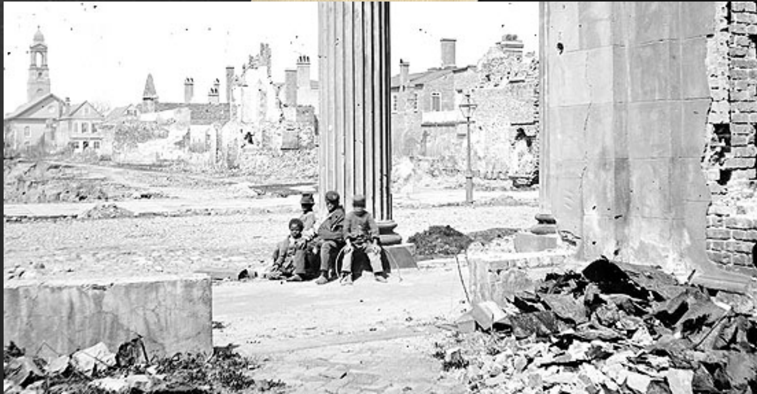
Refugees of the Civil War in Charleston, South Carolina during the Reconstruction era. August 1866.