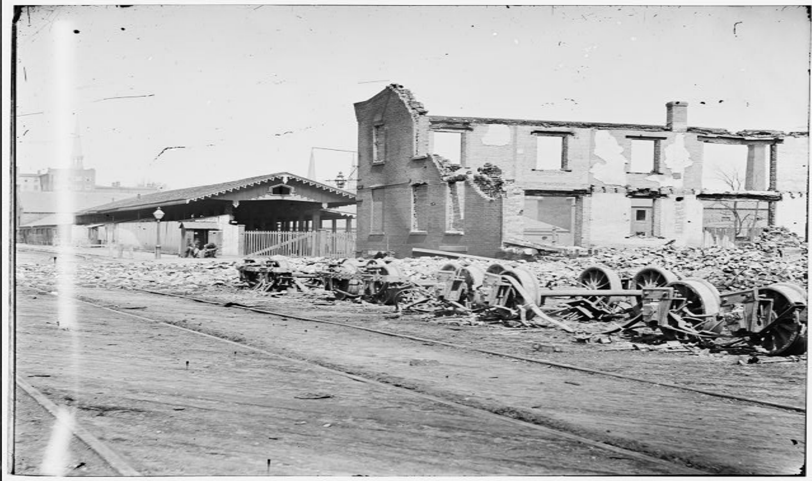
Picture of a southern Mississippi town after the Civil War had ended and what there was to restore.