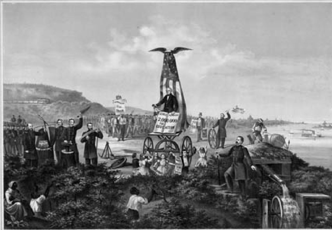
RECONSTRUCTION OF THE SOUTH.

This picture illustrates Reconstruction supported by farmers, mechanics, and laborers. It is also inviting African Americans to become citizens of the North.