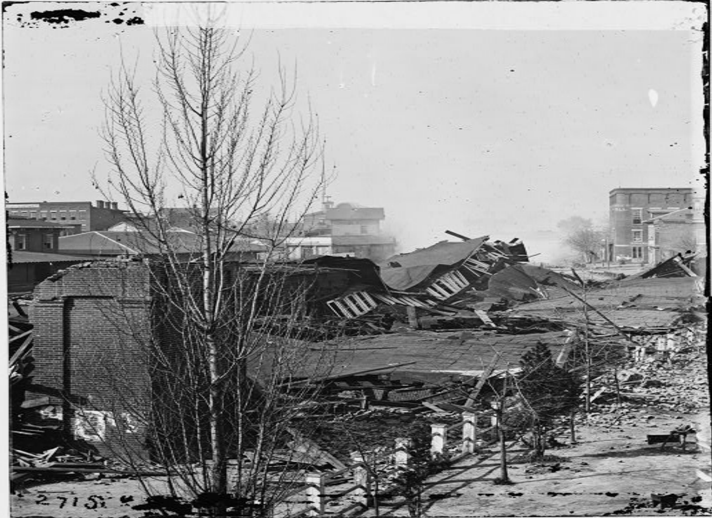
Another picture of Atlanta immediately after the Civil War.