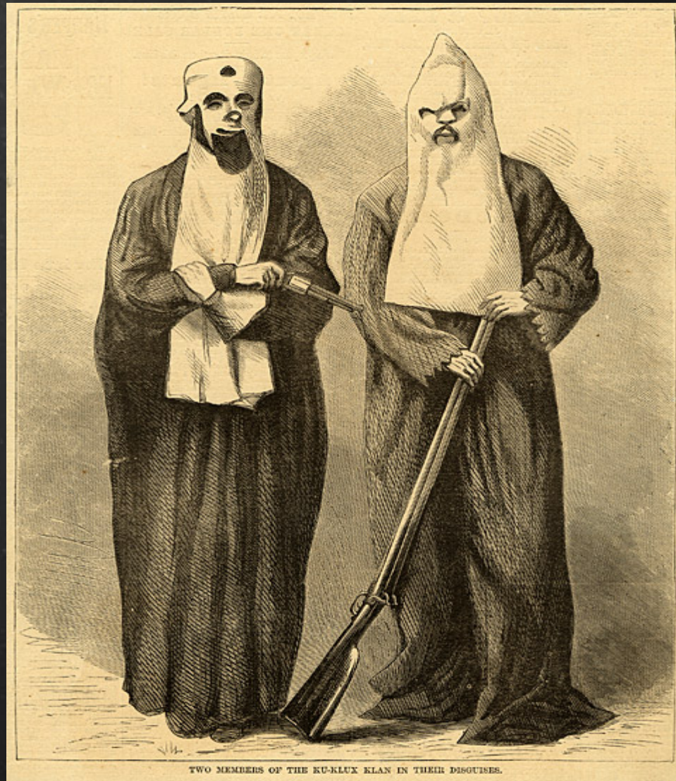
TWO MEMBERS OF THE KU-KLUX KLAN IN THEIR DISGUISES.

The KKK was founded in Pulaski, Tennessee to combat Reconstruction reforms and intimidate African Americans. This picture shows two klan members in their disguises.