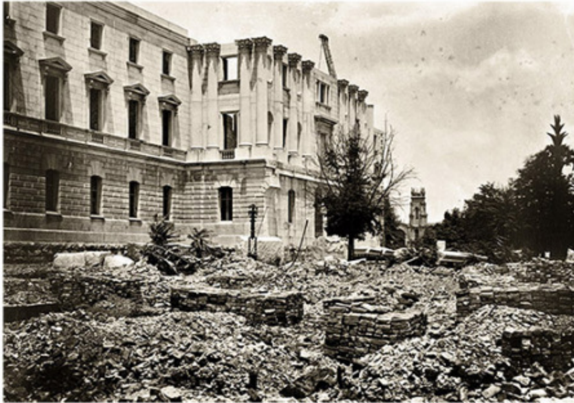
Reconstruction of the Capitol