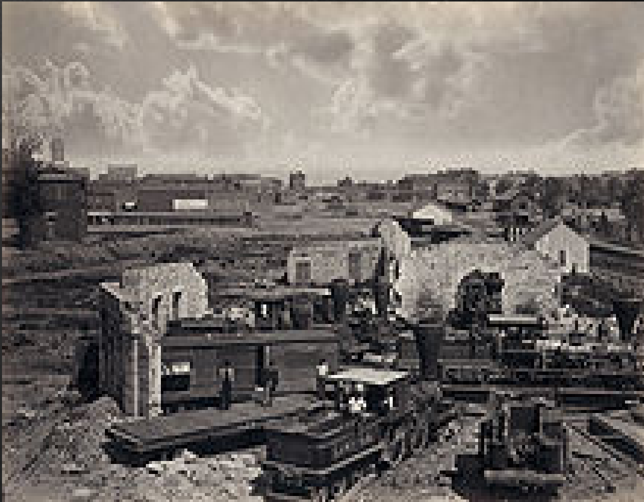
Atlanta's railyard and roundhouse in ruins shortly after the war.