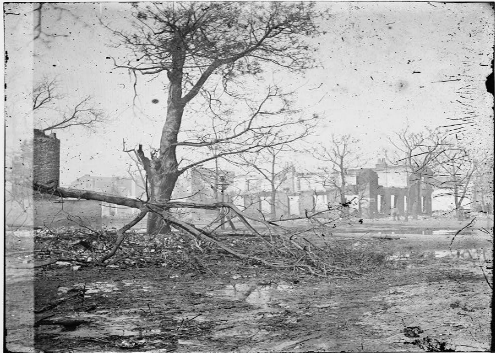
Picture of Savannah, Georgia and how it looked before Reconstruction took action.