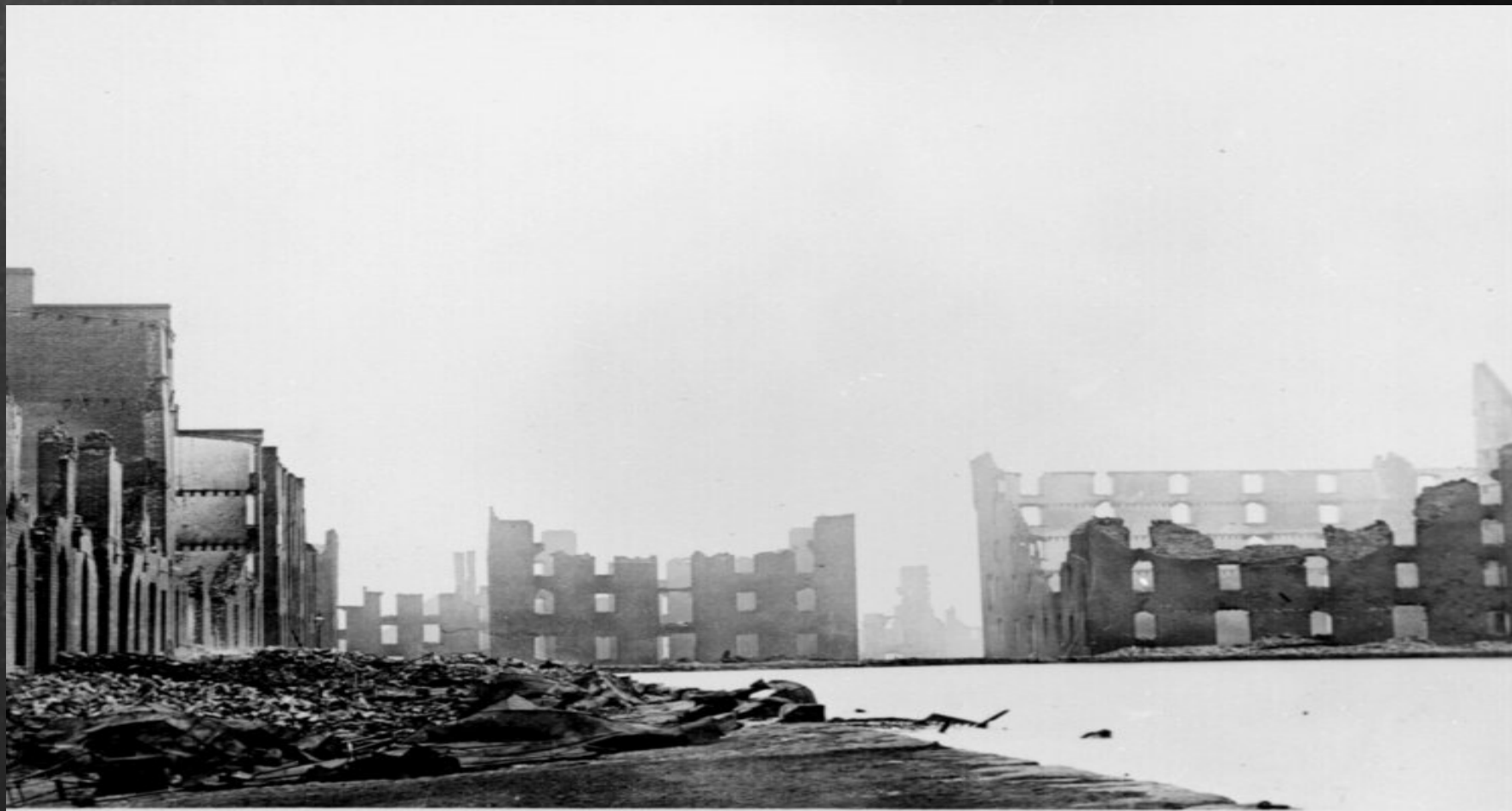
Richmond, VA in 1865 after the destruction of the Civil War.